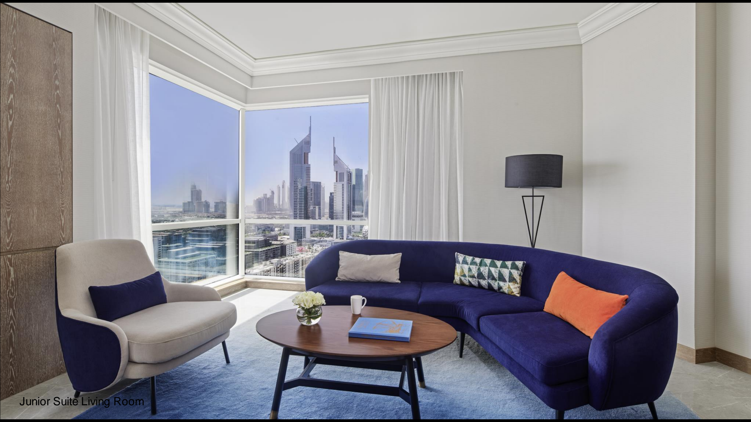
Junior Suite Living Room