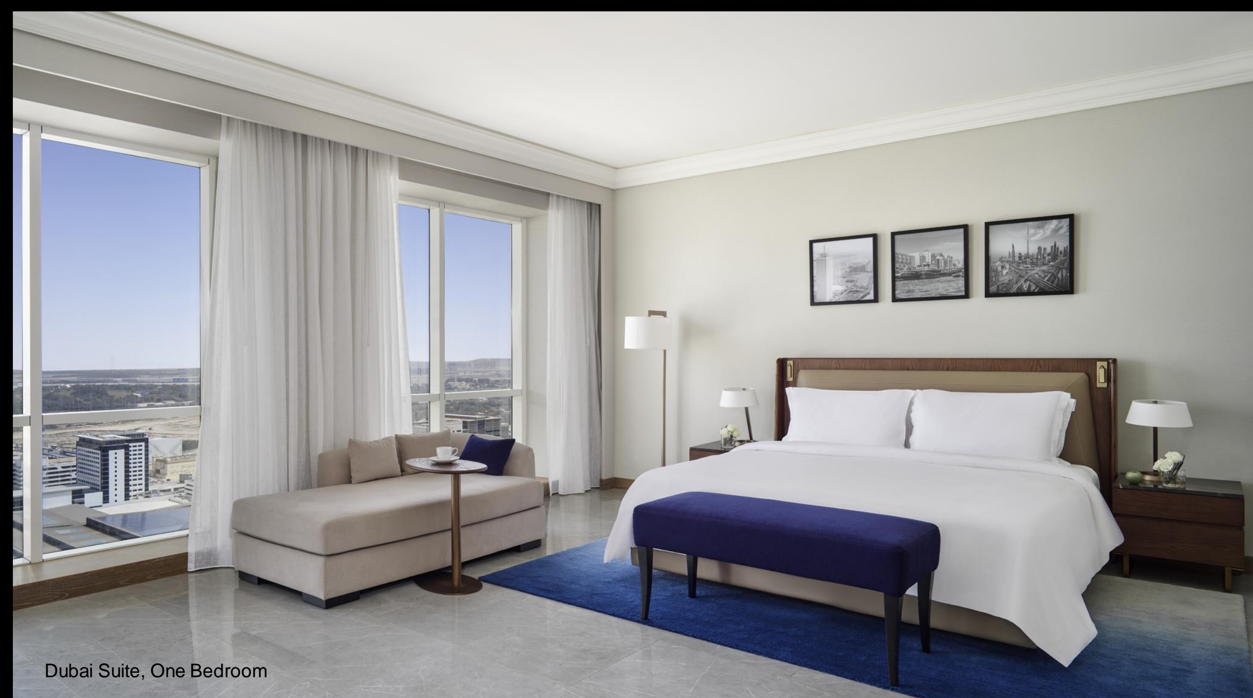
Dubai Suite, One Bedroom