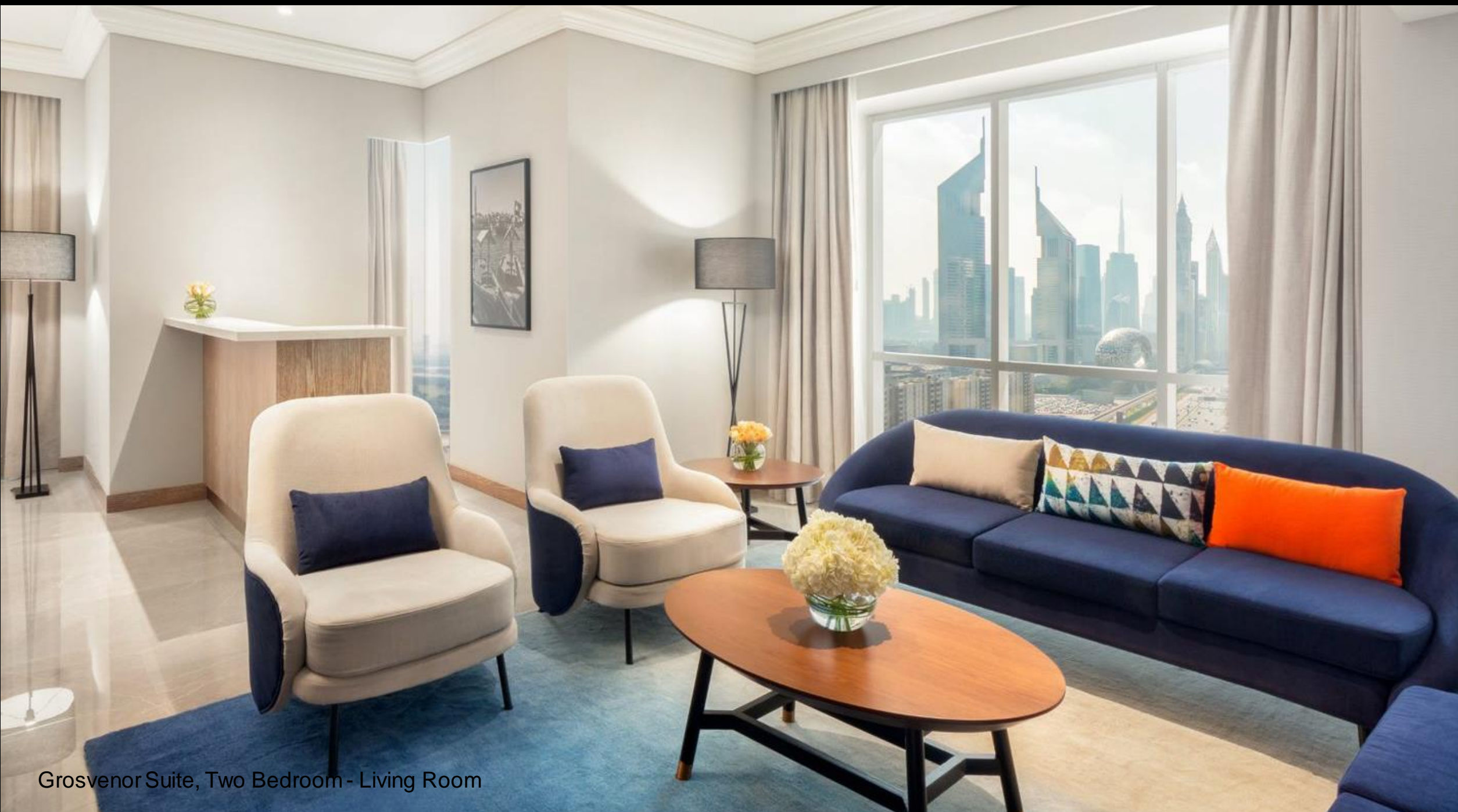
Grosvenor Suite, Two Bedroom - Living Room