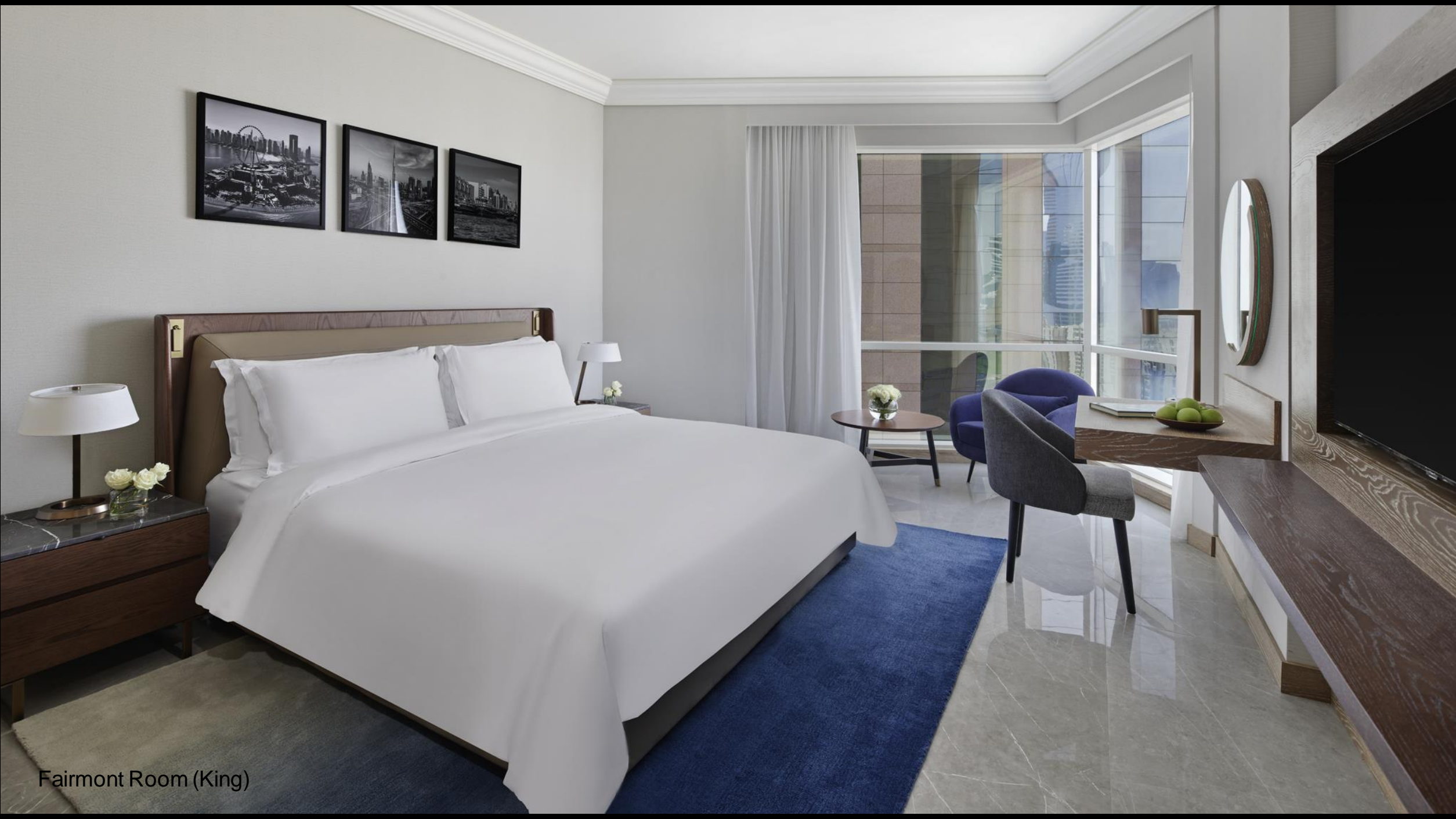
Fairmont Room (King)