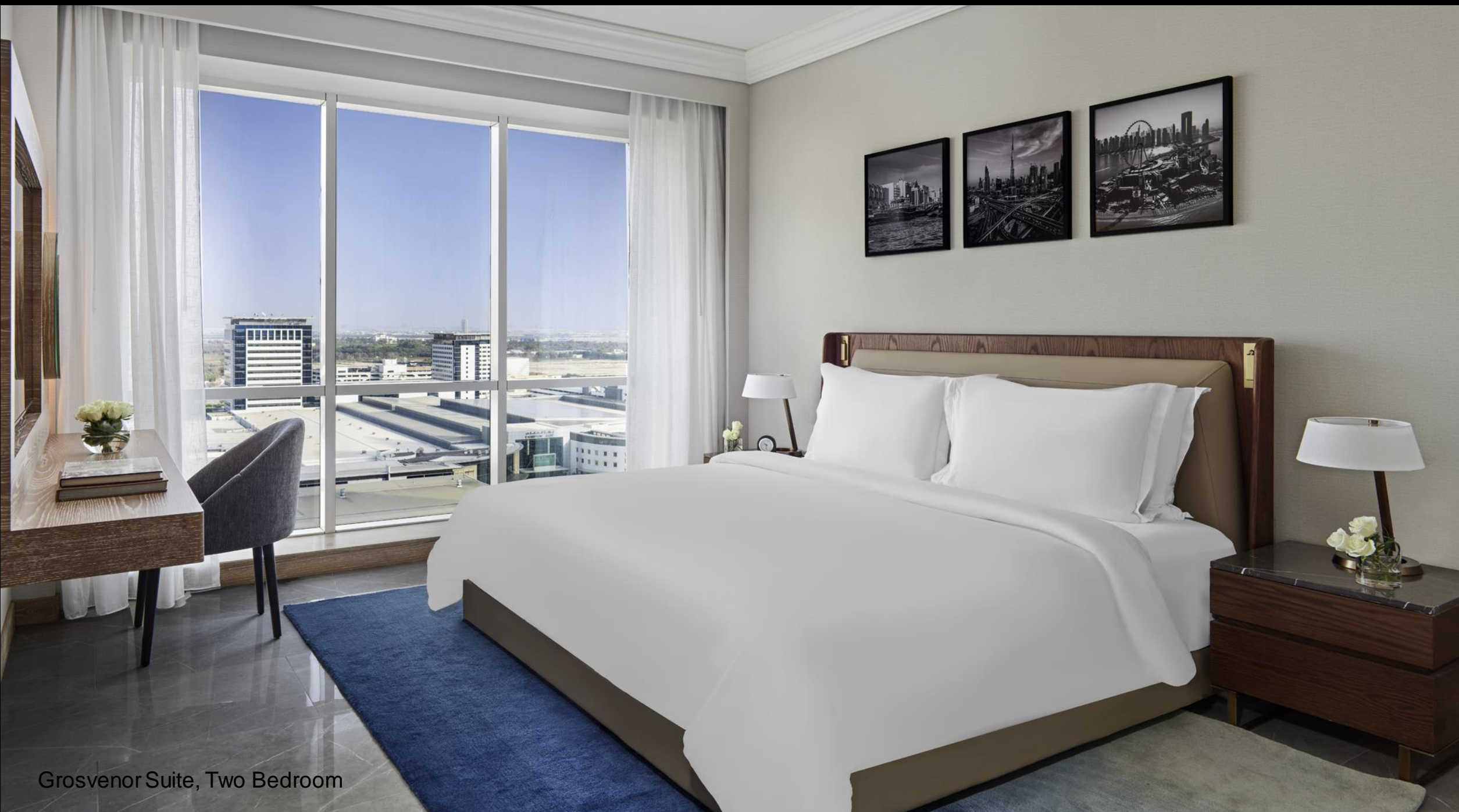
Grosvenor Suite, Two Bedroom