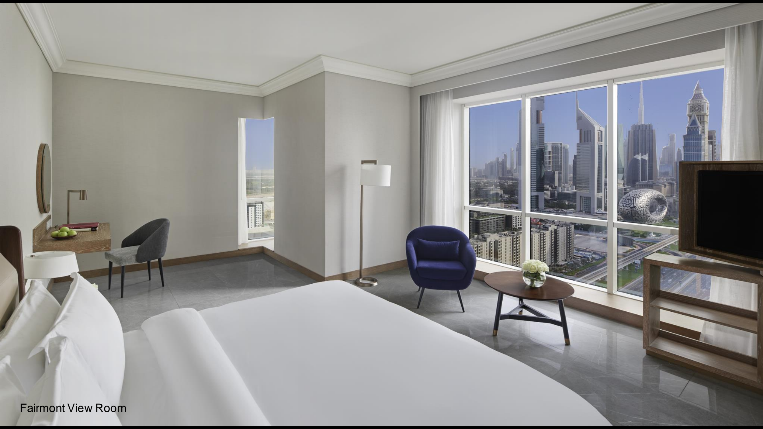
Fairmont View Room