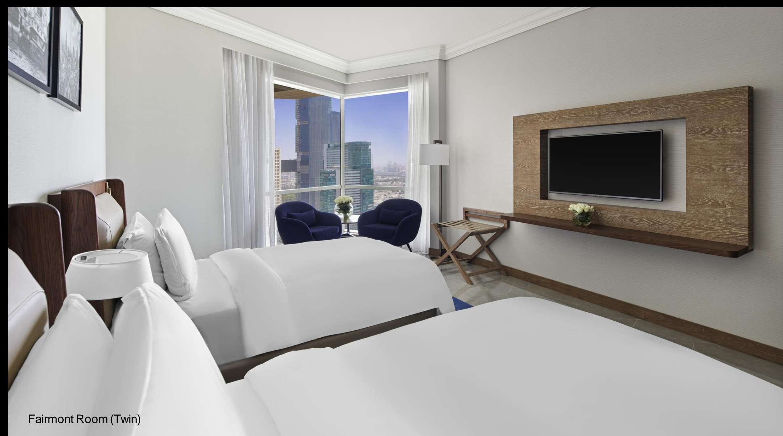
Fairmont Room (Twin)