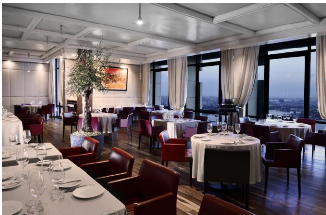
Le Toit d'Abidjan

DISCOVER THIS AMAZING ADDRESS, LOCATED IN THE HEART OF THE BEAUTIFUL CITY OF ABIDJAN WHERE SOFITEL COMBINES FRENCH LUXURY, KNOW-HOW AND AFRICAN CULTURE TO CREATE A UNIQUE EXPERIENCE FOR ITS GUESTS.