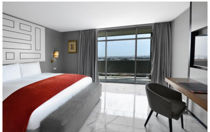
Opéra Suite - Bedroom

Free Wifi - Nespresso Machine - Led TV HD - Mini Bar