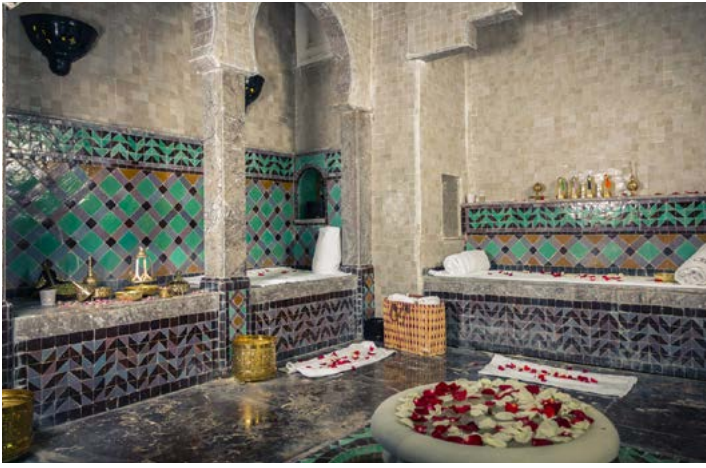
So SPA Rabat