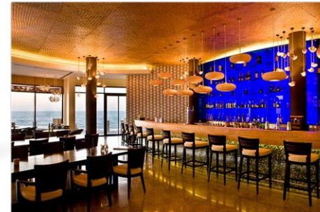
TAPAS BAR & RESTAURANT