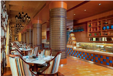
PASHAWAT ARABIC RESTAURANT