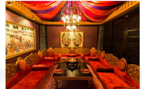
RIVA AJ INDIAN RESTAURANT