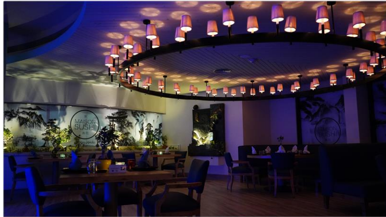
MAISON SUSHI JAPANESE RESTAURANT