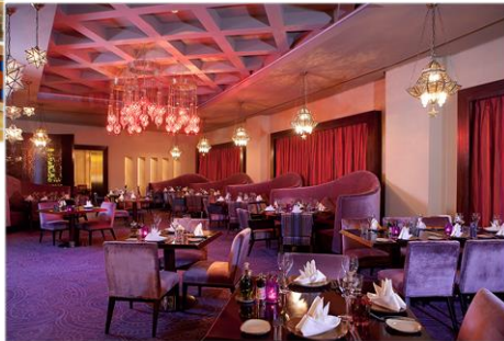
PASHAWAT ARABIC RESTAURANT