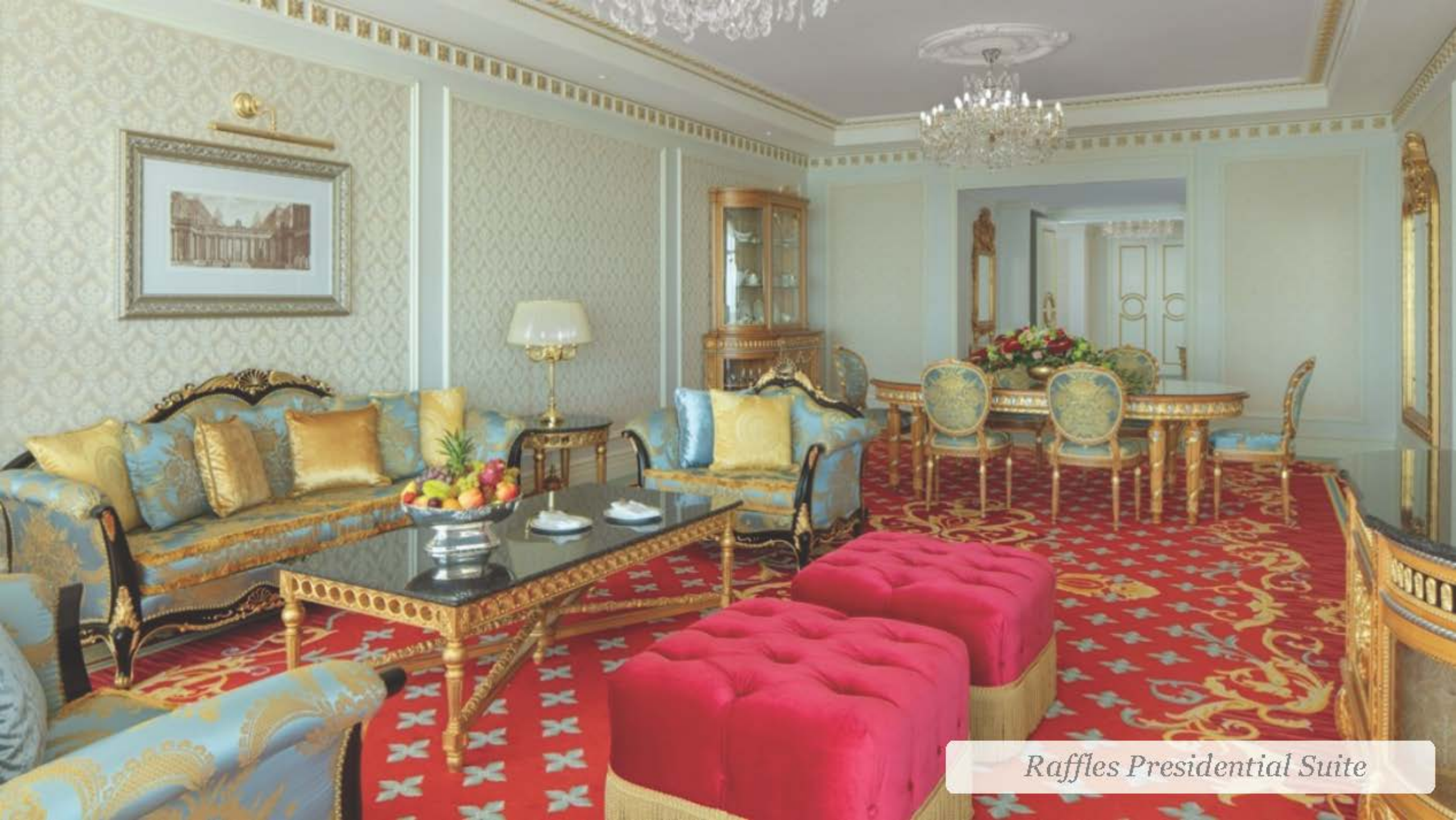
Raffles Presidential Suite