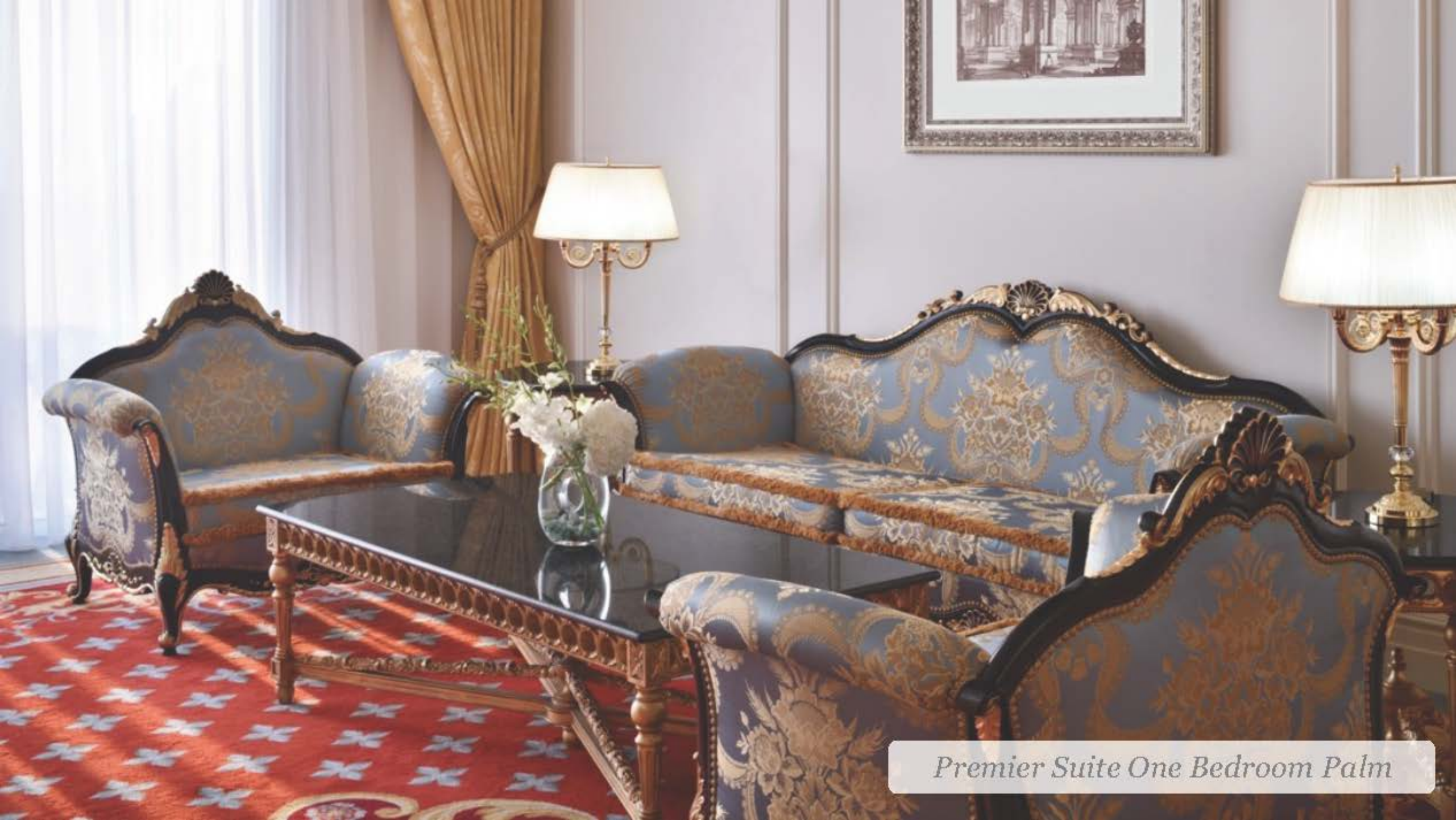
Premier Suite One Bedroom Palm