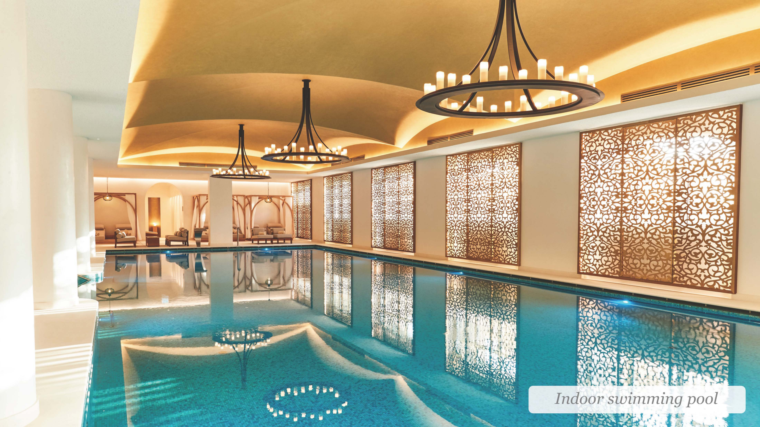
Indoor swimming pool