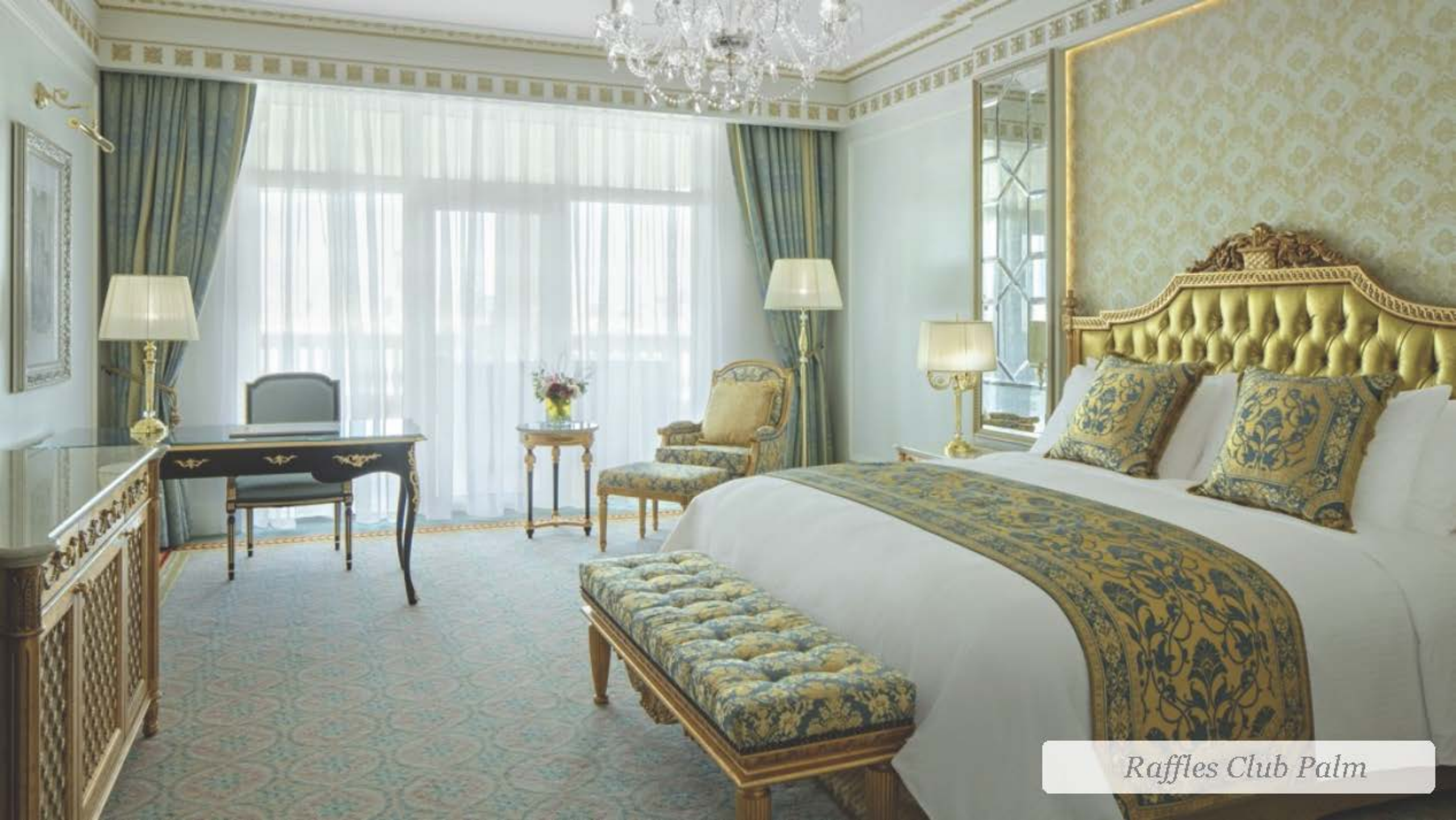
Raffles Club Palm