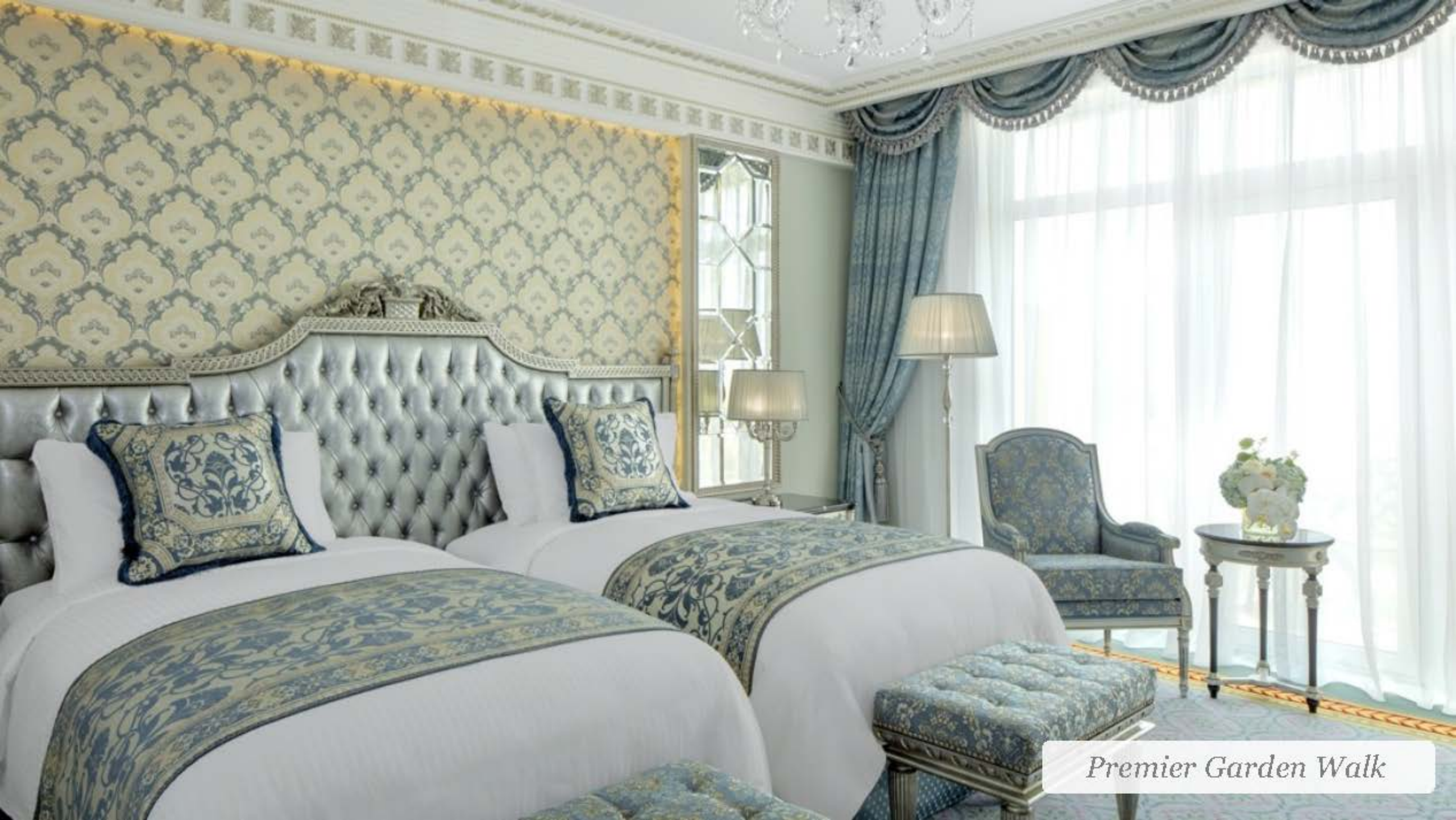
Premier Garden Walk