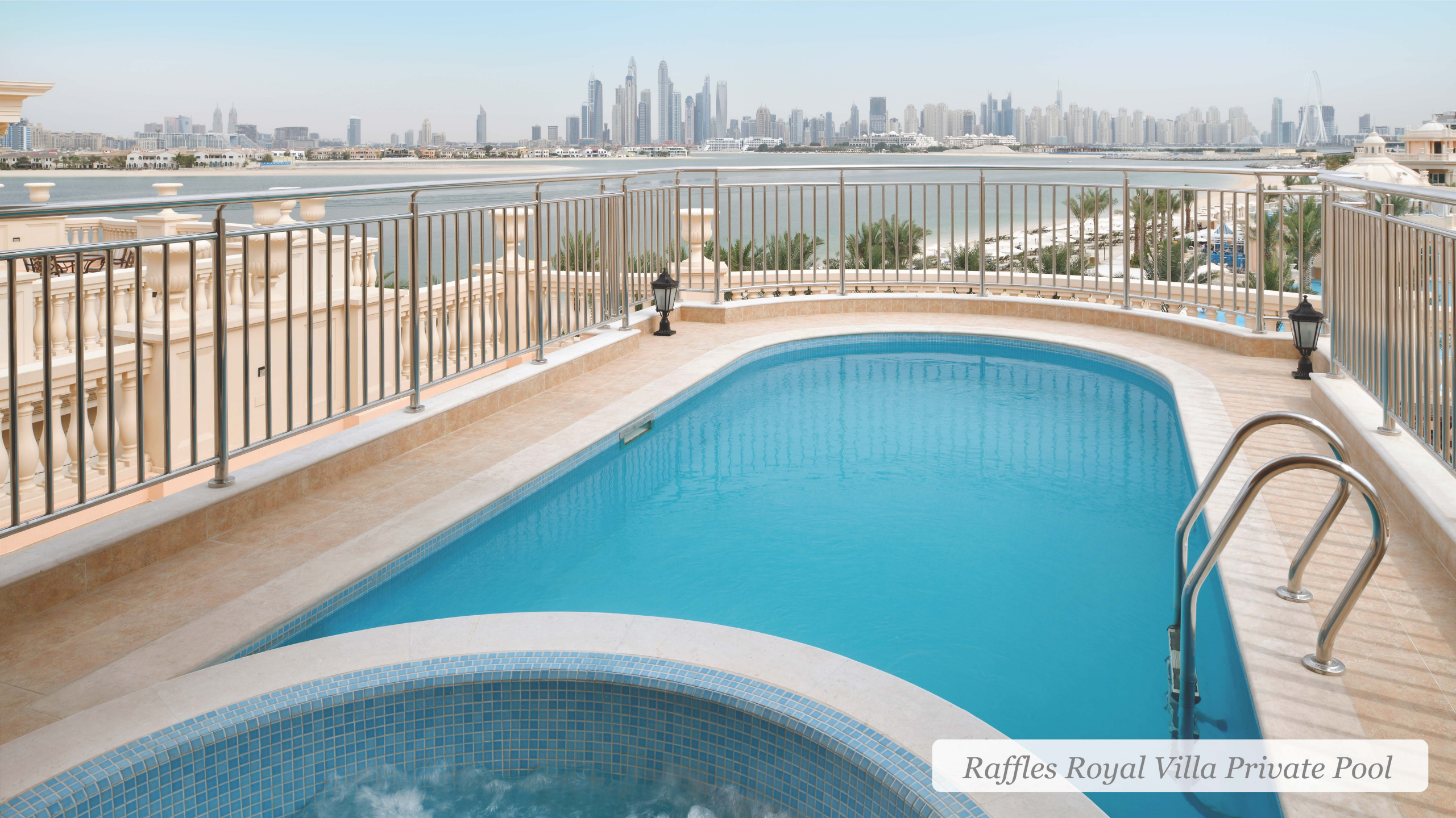
Raffles Royal Villa Private Pool