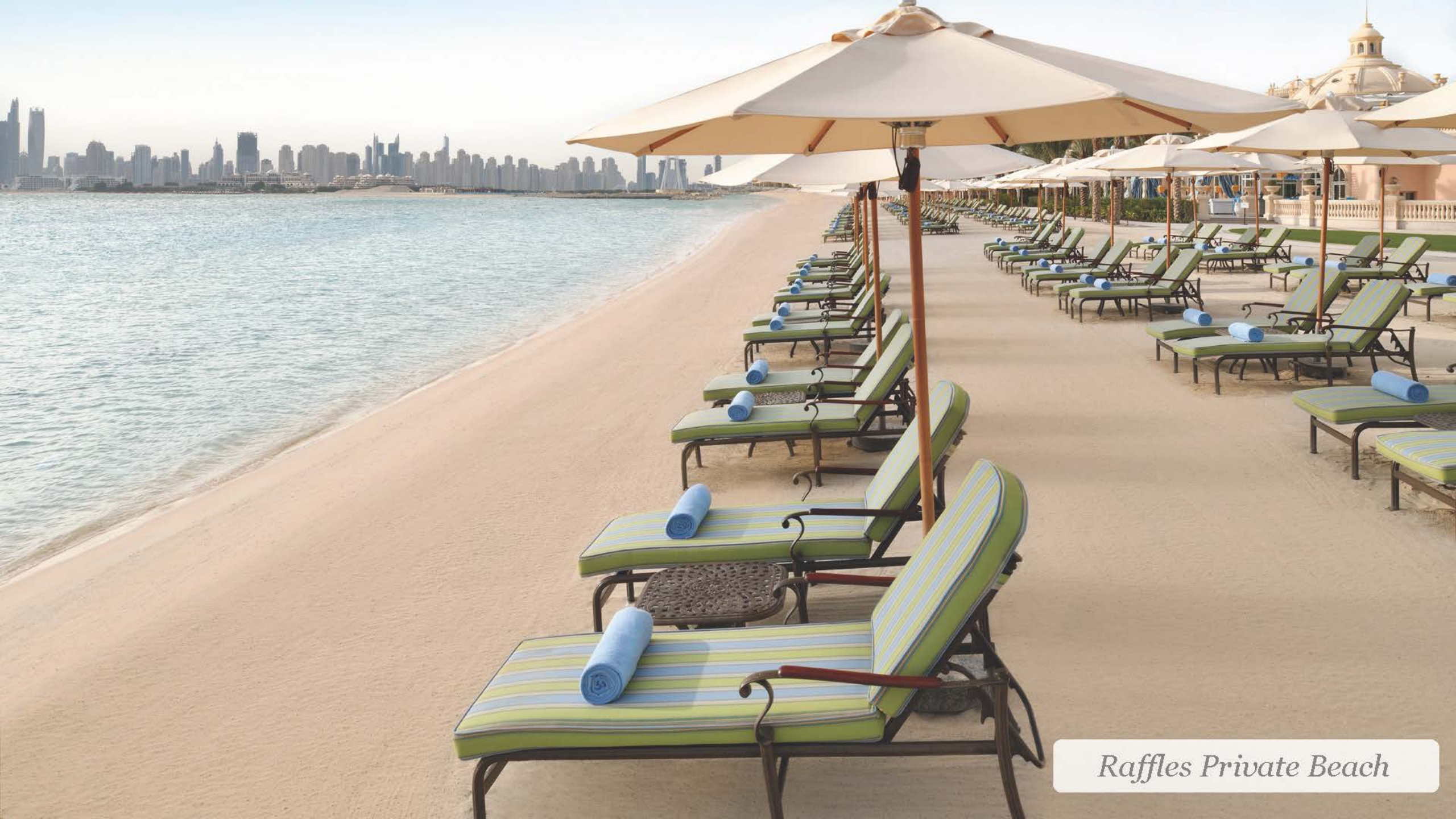
Raffles Private Beach