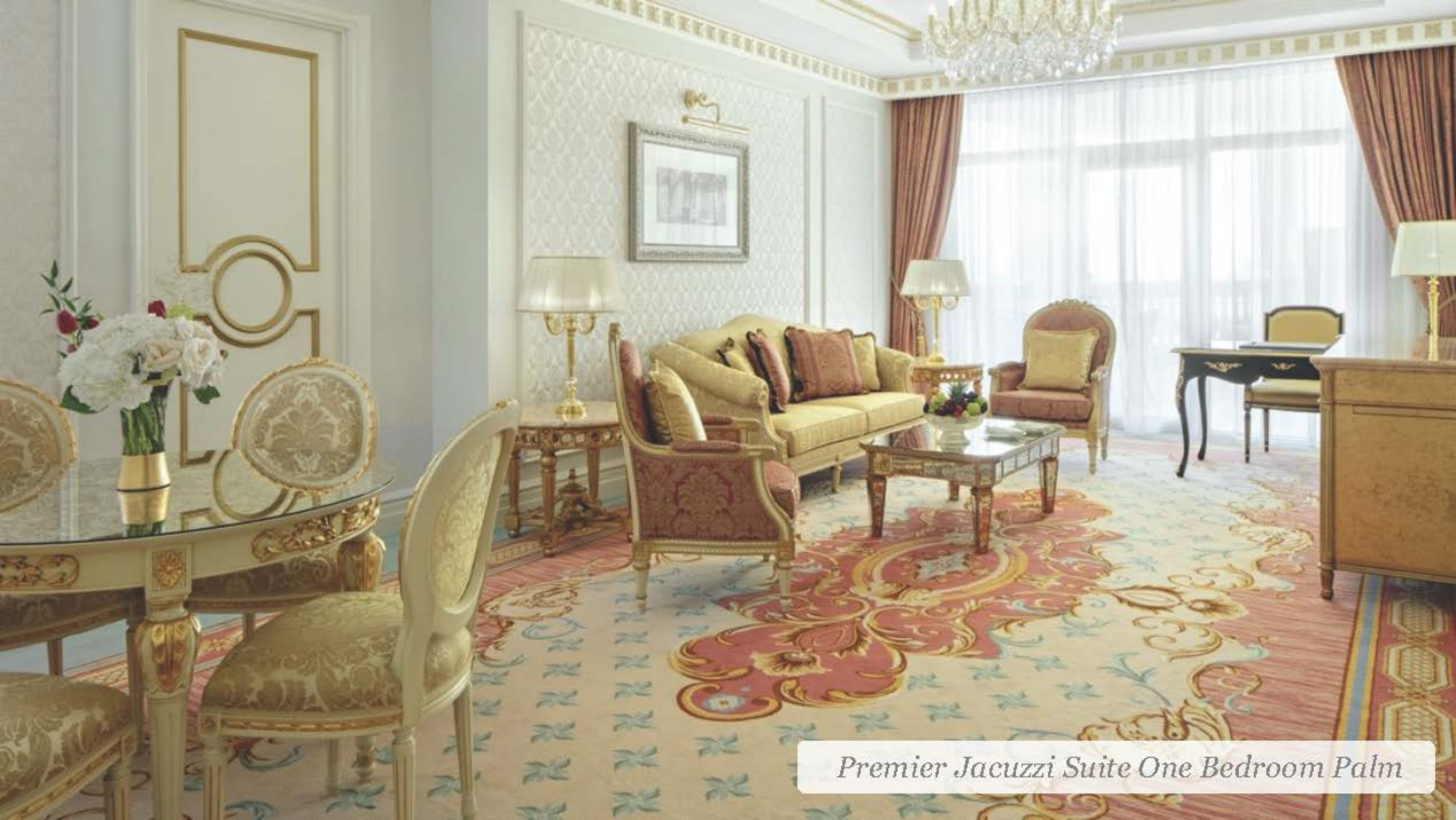
Premier Jacuzzi Suite One Bedroom Palm