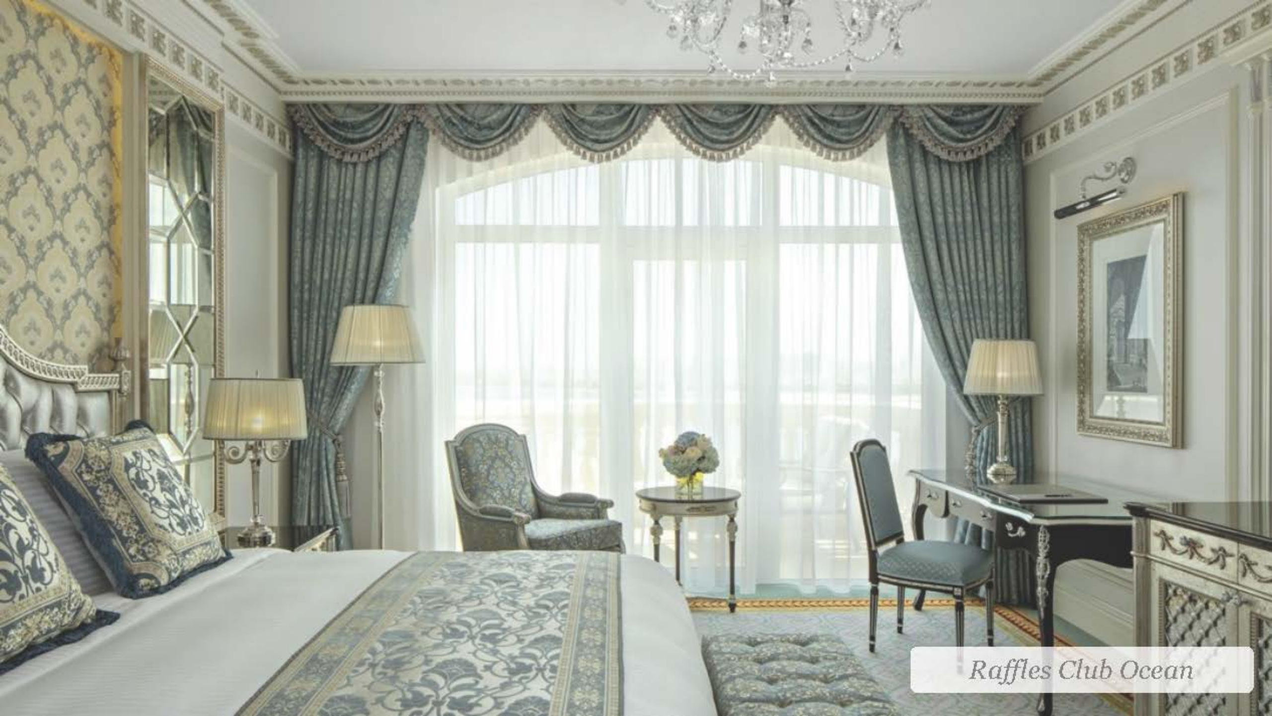
Raffles Club Ocean