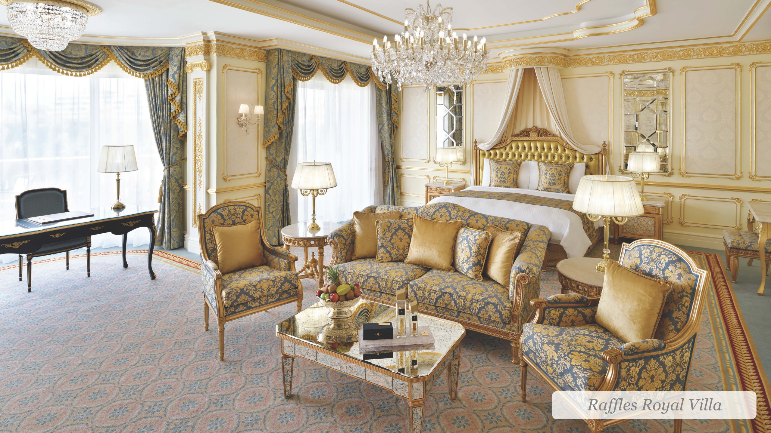
Raffles Royal Villa