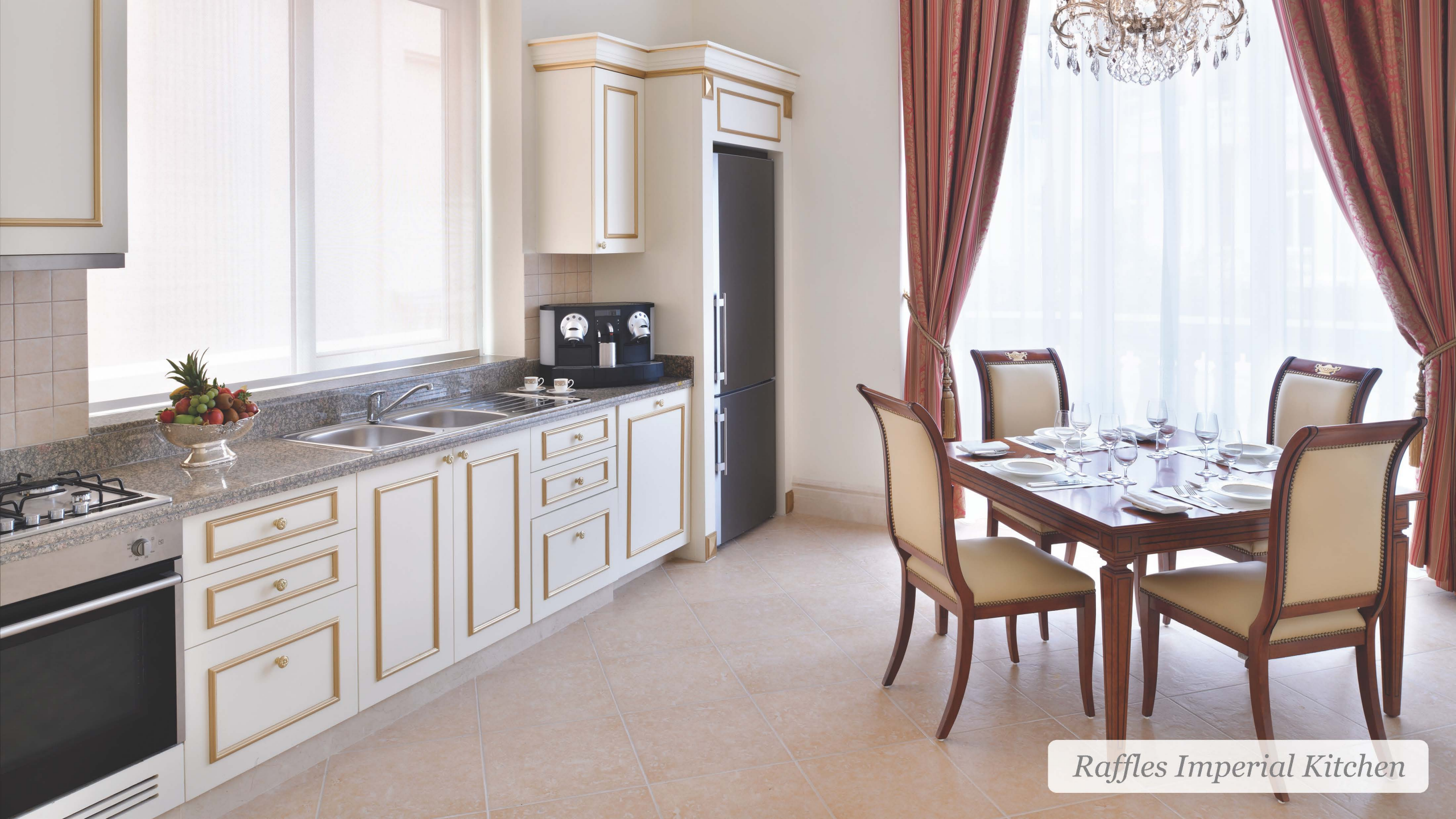
Raffles Imperial Kitchen