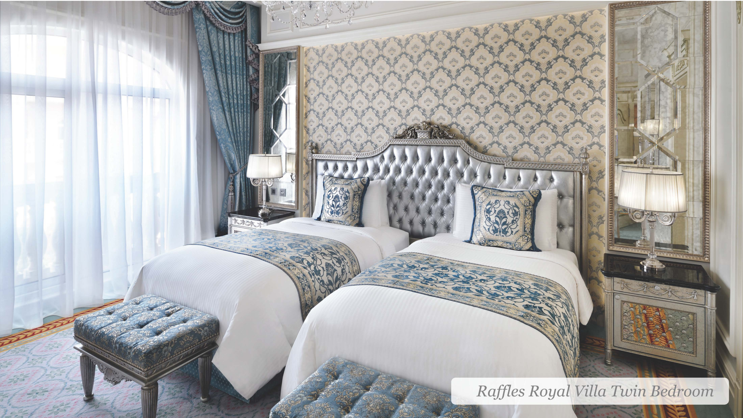
Raffles Royal Villa Twin Bedroom