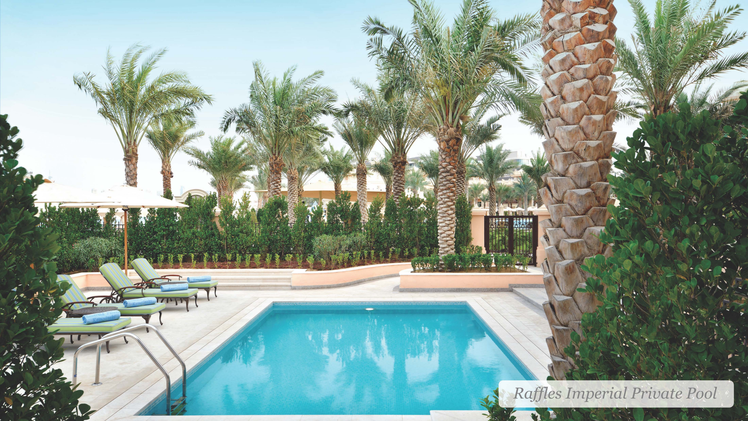
Raffles Imperial Private Pool