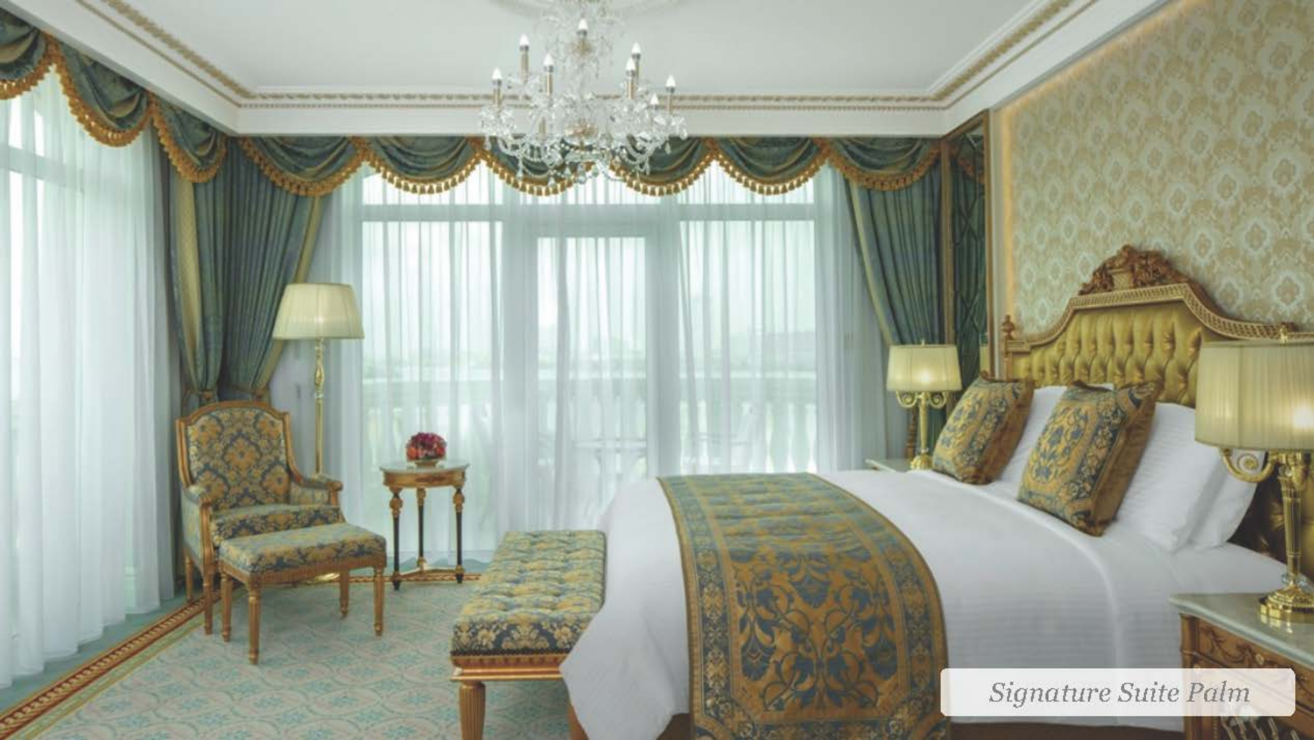
Signature Suite Palm