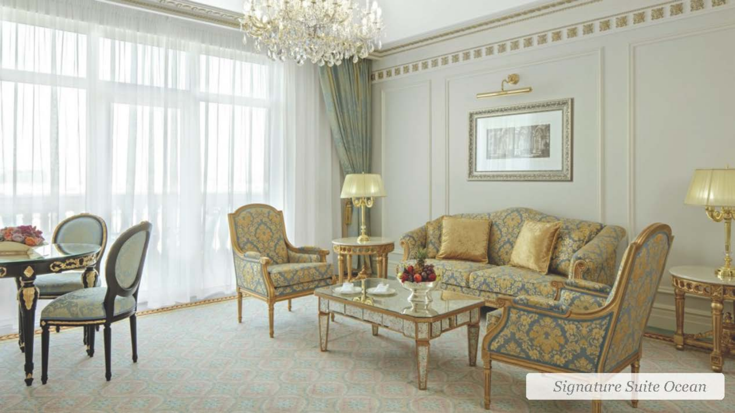
Signature Suite Ocean