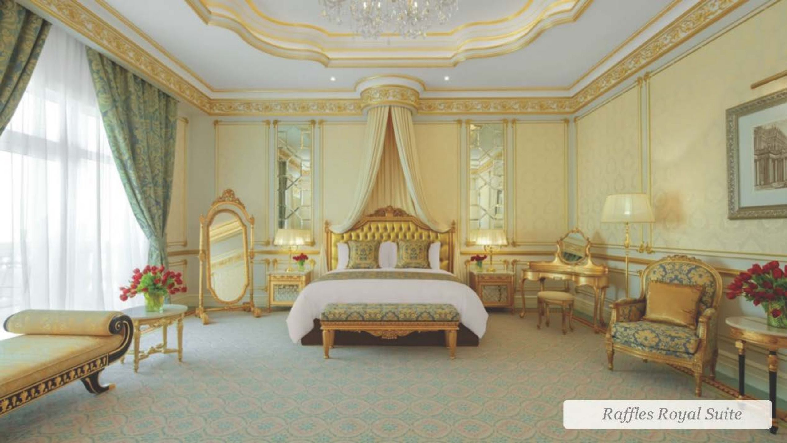
Raffles Royal Suite